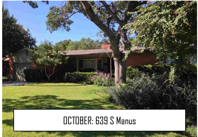
OCTOBER: 639 S Manus

Congratulations to the fourth quarter winners who receive a gift certificate from Calloway's nursery. We invite you to participate in the selection of our neighborhood's best yards. On the 1st of the month, nominate a yard for consideration at www.wynnewoodnorth.org/yom-nominations . Return after the 15th to cast your vote. Please support our Yard of the Month sponsor at any of their convenient locations. Store locator online at www.calloways.com .