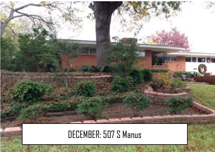
DECEMBER: 507 S Manus