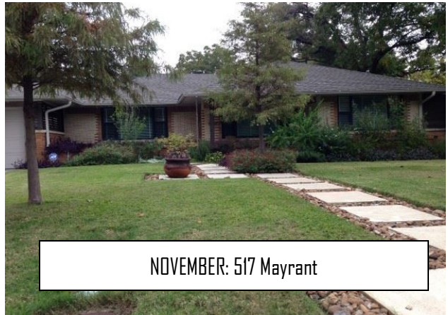
NOVEMBER: 517 Mayrant