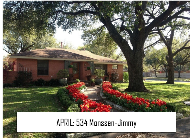
APRIL: 534 Monssen-Jimmy

Return after the 15th to cast your vote. Please support our Yard of the Month sponsor at any of their convenient locations. Store locator online at www.calloways.com .