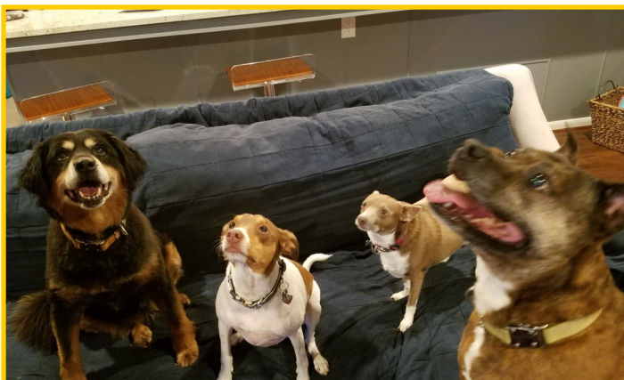
TOP CENTER: Tator Tot From 1615 Shelmire. Shy & Innocent!