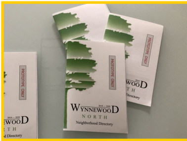
ABOVE: The new directory.

During March, our block captains contacted most of you to validate your contact details for the directory. Teri Lipscomb (our webmaster) is now updating our database with your details.