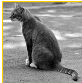
ABOVE LEFT: Big Boy, the Shelmire Cat - 1717 Shelmire

Like as an oxford comma in a New England trucking contract, I was nowhere to be found. I'm not sure where I was. Occasionally, I thought I