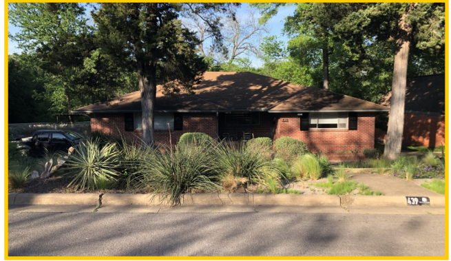
ABOVE: Marilyn and Paul Jolly have multiple different plantings and beds to reflect the native Texas flora.

MJ: Well, you might end up buying trees that, when fully grown, have an adverse effect on your property. They may limit your view, your property value, or your design [with other trees and beds]. One big offender is the Bradford Pear. They are an invasive species that harms the environment, and they last only 10 years before nature rips them apart. Ten years is a long time for trees. Once a Bradford Pear dies, your