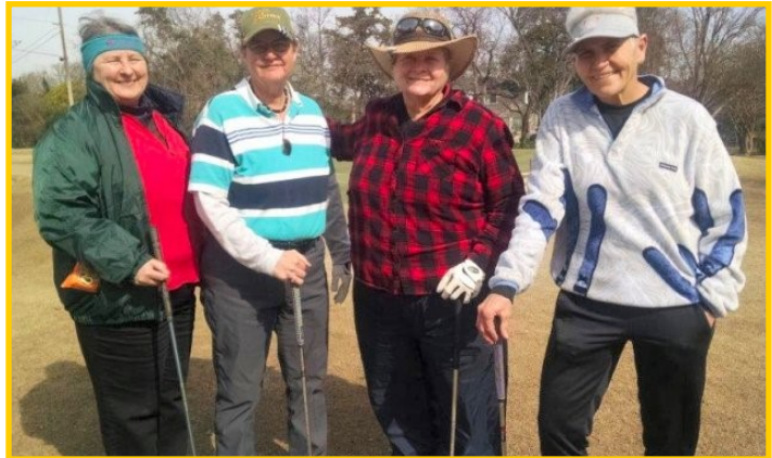
ABOVE: These women rocked the course at a recent local golfing tournament. To see the color photos and read about their accomplishments, check out the blog on WNNA.org on April 15th when we release their story: Golfing for Greatness!