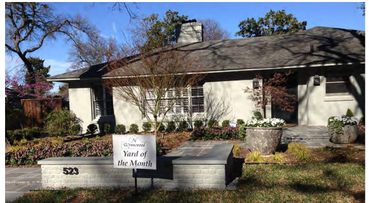
MARCH — 523 Hoel