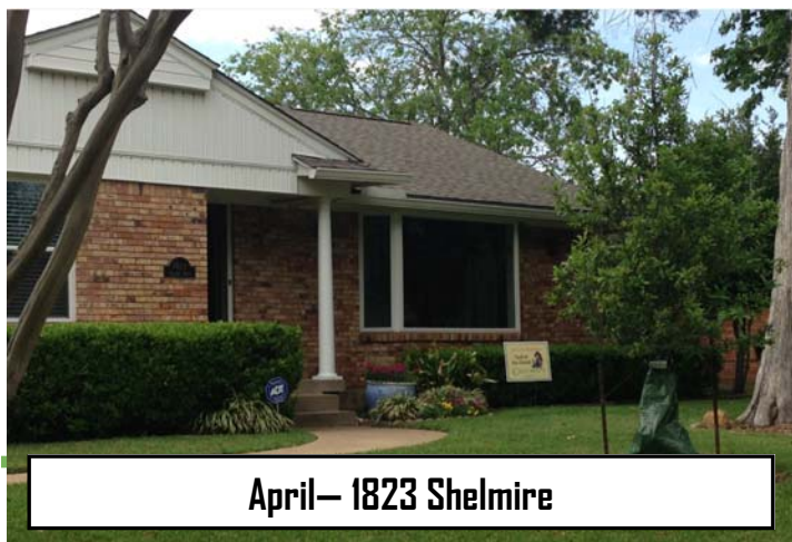
April— 1823 Shelmire