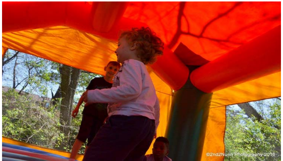
Getting their groove on at Spring Fling 2016

ALL OF OUR TECHNICIANS OUR EPA CERTIFIED, STATE REGISTERED, AND BACKGROUND CHECK APPROVED