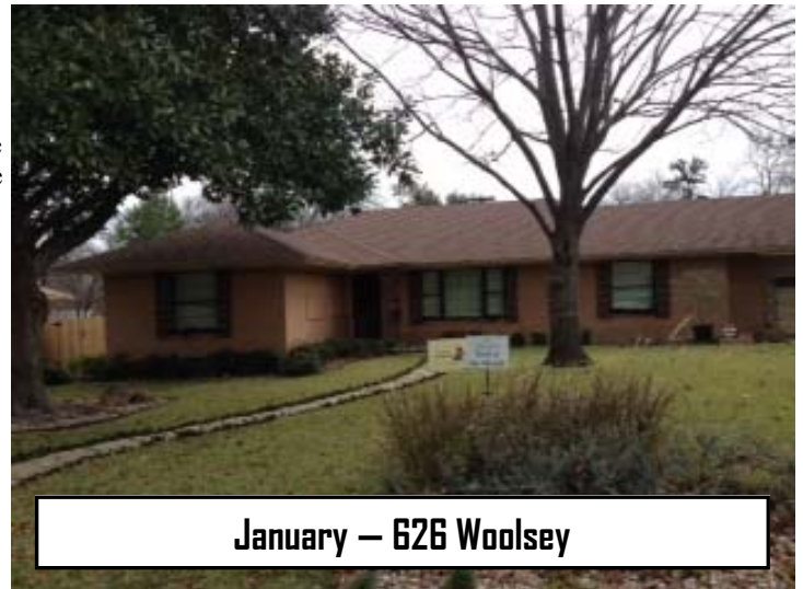
January – 626 Woolsey

Each recipient of Yard of the Month receives a gift card compliments of Calloways. We have many beautiful yards in our neighborhood. Please remember to nominate homes for Yard of the Month. An eblast is sent out notifying residents when it is time to nominate homes or Yard of the Month. We will limit each home to receiving this designation only once per year. As all prepare for the spring season, note Calloway's has provided helpful tips and a coupon to be used on the purchase of your spring plants and supplies.