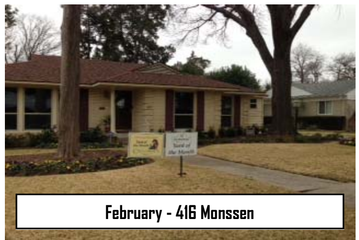
February - 416 Monssen