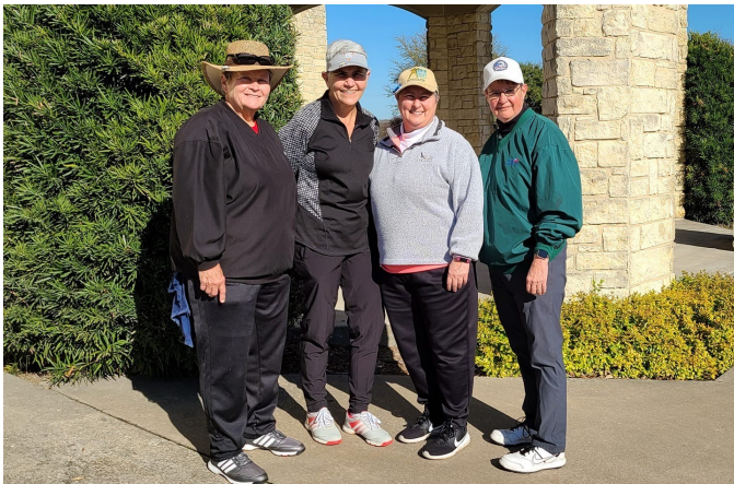
Wynnewood North Residents participated in the Dallas Senior Games