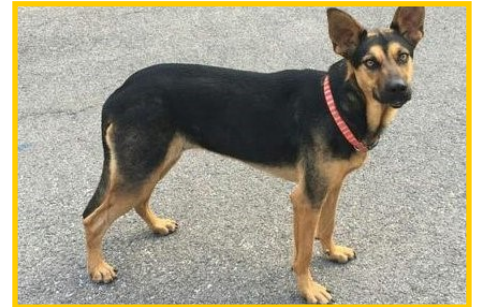
Above: This pet was microchipped and rescued in our neighborhood on July 4th.

Yes, and that used to be a problem. Competing microchip companies use different frequencies to send signals to scanners, and until recently