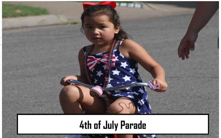
4th of July Parade

This will be a great opportunity to re-connect with old friends or make some new ones in the neighborhood!